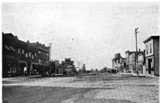
MAIN STREET, GARNER